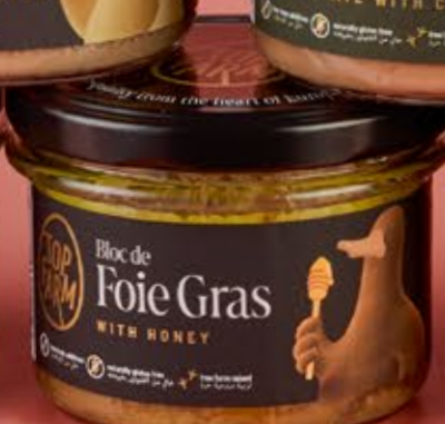
Duck paté with cranberries