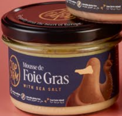
Duck liver in duck fat